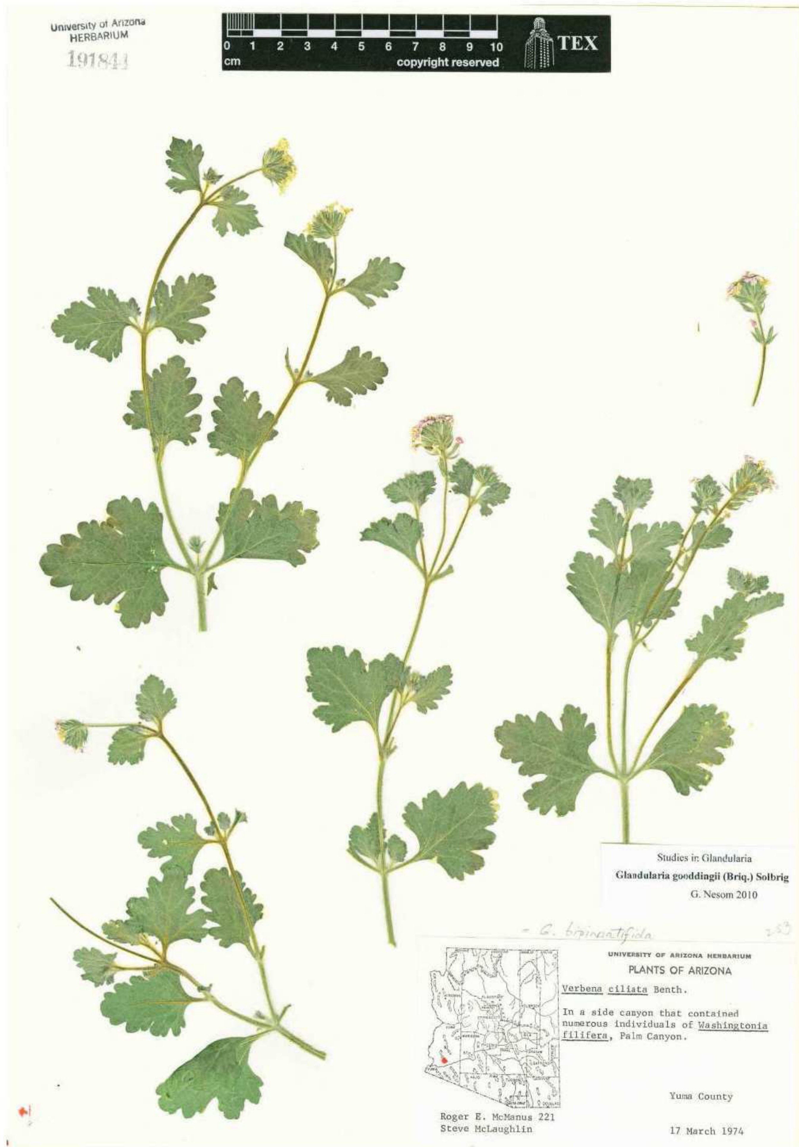
Figure 4. Glandularia gooddingii , leaves coarsely toothed to moderately dissected.